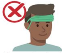
On your forehead