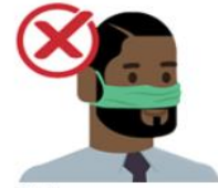
Only on your nose