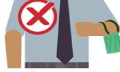
On your arm