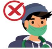
Under your nose