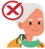
Around your neck