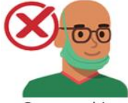
On your chin