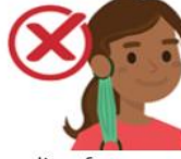
Dangling from one ear